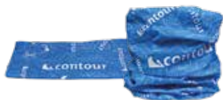
contour Buff® multifunctional tubular