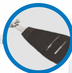
backing film is split into three sections