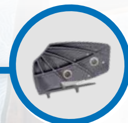
offset cutter, included with all hybrid skins