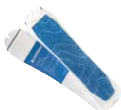
contour demoski for all skin types