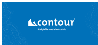
contour banner (small) 120 x 50 cm