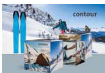
contour POS Package 2 cubes 30 x 30 x 30 cm (large) 1 cubes 15 x 15 x 15 cm (small) 1 banner 100 x 70 cm 1 banner 50 x 100 cm